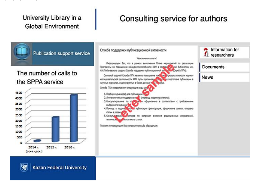
Figure 2. Consulting service for authors

The main task of the service for the support of publication activity is the work with authors, especially young researches, to prepare their articles for publication in international scientific periodicals. Young researchers, postgraduates, and undergraduates are taught academic writing skills and the structuring of the material. Also, the service offers assistance with the redaction and the translation of the text into English language (Figure 2).