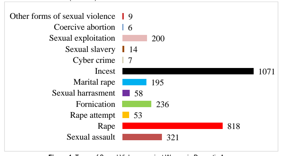
Figure 1. Types of Sexual Violence against Women in Domestic Areas

Restriction of incest practices in Indonesia is stipulated in the 1974 marriage law, number 1, articles 8-11 (Safira, 2012). Incest perpetrators are punished differently in different countries. In Indonesia, they are sentenced between 3 to 12 years in jail (RUU KUHP) (Eddyono: 2016). In countries like India, Saudi Arabia, Iran, Afghanistan, and China, the death sentence is sanctioned as a punishment of their crime(Sutarnio & Nansi: 2017; Tursilarini: 2018, pp. 77-92). Below is a list of the types of sexual violence against women in domestic areas in Indonesia (Picture 1):