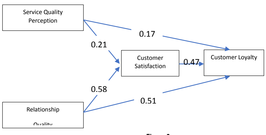
Figure 2. Empirical model of service quality and relational quality

According to the research result and testing of the hypothesis above, an empirical model can be found as shown in Figure 2.