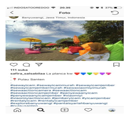
Figure 2: Sharia beach's visitor's posting.