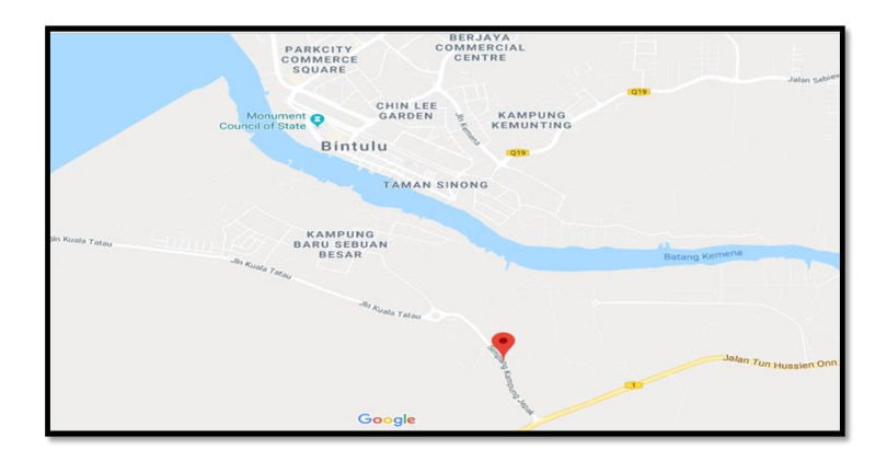
Figure 3: Kampung Jepak, a Vaie community in Bintulu located along the river