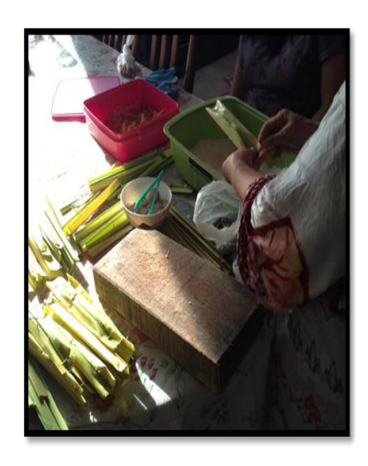
Figure 5: The traditional Ti'ong been wrap in Nipah leaves for grilling

Another special food of the Vaie community is the linut. It is made up of sago powder or raw sago thereby making it tasteless and sticky. The preparation of linut is simply by adding boiled or hot water into the sago. Some also prepare linut by adjusting the temperature of hot water pouring it slowly to the sago powder. After which the mixture is stirred continuously to achieve a homogeneous linut (Figure 6). Usually, the linut is served with some sideway dishes such as sambal and fried fish (Figure 6).