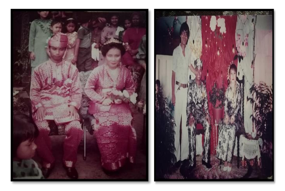
Figure 4: Traditional wedding event of Vaie dressed in traditional costume of black, white, and red colours