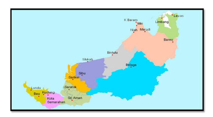
Figure 1: The map of Sarawak with Bintulu in the central location in the state.

rapid development and increasing population (Ho, 2008). Additionally, Bintulu is located strategically at the heart of Sarawak thus 650 kilometers from Kuching City and about 215 kilometers from Sibu and Miri (Figure 1). In terms of population, we observed that most Malays, Melanau, and China stay and build their homes in Batang Kemena. For the Iban community, most of them live in the Sebauh and Pandan Rivers. For Ulu communities such as the Kayan, Kenyah and Penan communities, many of them live in the areas of Tubau and Sungai Jelalong. Whereas the Vaie communities' lives in Bintulu and its villages such as Kampung Masjid, Kampung Sinong, Kampung Datuk, Kampung Sibiew, Kampung Baru, Kampung Jepak, Kampung Sebuan, Kampung Batu Sepuluh, and Kidurung (Figure 2). Among the communities, Kampung Jepak was chosen for this study because it has the largest Vaie village with a higher population of Vaie people (Figure 3).