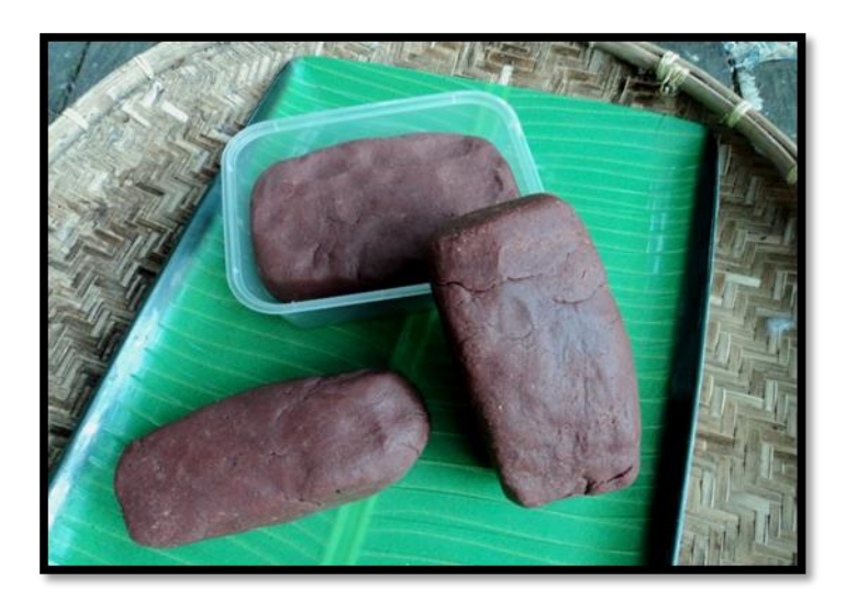
Figure 7: Cubic and solid belacan that is used to prepare sambal

The uniqueness of the Vaie language and how different it is from Melanau