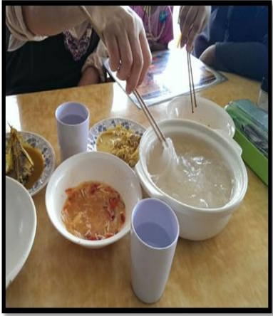
Figure 6: Linut served with sambal and fried fish in a unique traditional style

Belacan is one of the Sarawak state traditional food served in Sarawak and it is a unique food found mostly in every single household of Vaie (Figure 7). The belacan have a strong smell and give a strong taste compare to others. The main ingredient of the belacan is dried small prawns. The prawns are mixed with sugar, salt, and other seasoning and crunch into a solid cube (Figure 7). The belacan act as seasoning because it always added into dishes like kangkung and majority of it is used in sambal preparations.