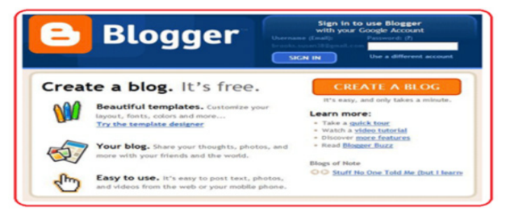
Figure.2. A profile Page on Blogs.

The word blog is taken from the word web log . Blogs are another reprehensive of social media . According to (Weber, 2009:36), Blogs let user to publish and participate in a multithreaded conversations online. One rich source of language texts are blogs, which can be thought of as online diaries or journals. The word comes from a combination of 'web' +'log' can be private and controlled with passwords, or public, depending on the desire of author. Most blogs allow for visitors to post comments. Since blogs are written by people remarking on their travels, daily life, current events (Freeman and Anderson, 2012: 210).