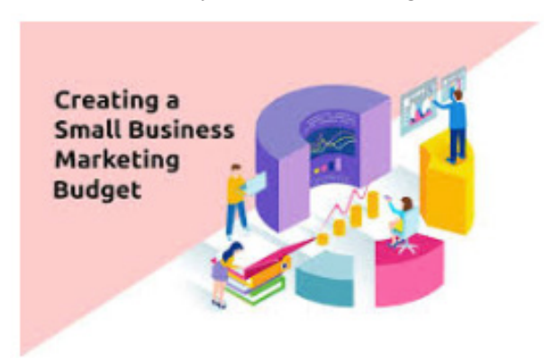
Fig.1: Creating budget of revenue on business

Create and update budget review the assumptions in regard to the business and company is business setting that were used because the basis for the last statement, create and update as compulsory. Review interrupt verify the capability level of the first interrupt that is confining the corporate from creating any sales, and outline however these can consequence any further business revenue growth. Accessible finance verify the foremost seemingly quantity of finance that may be out there throughout the budget amount,