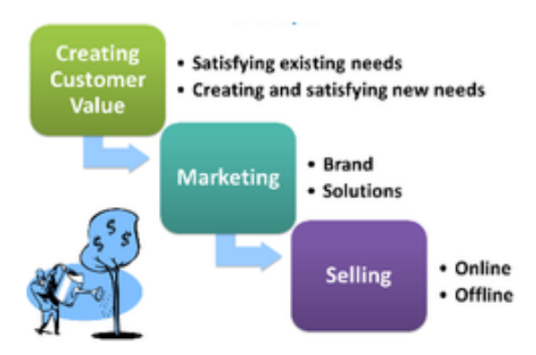
Fig.1: Revenue model on business

The creating customer value is satisfying existing needs the revenue business. Satisfying existing needs to business and marketing. The long term planning on revenue on business is based on the creating customer value, marketing and selling. The business is depending on the product brand and solution. The product is selling online and offline.