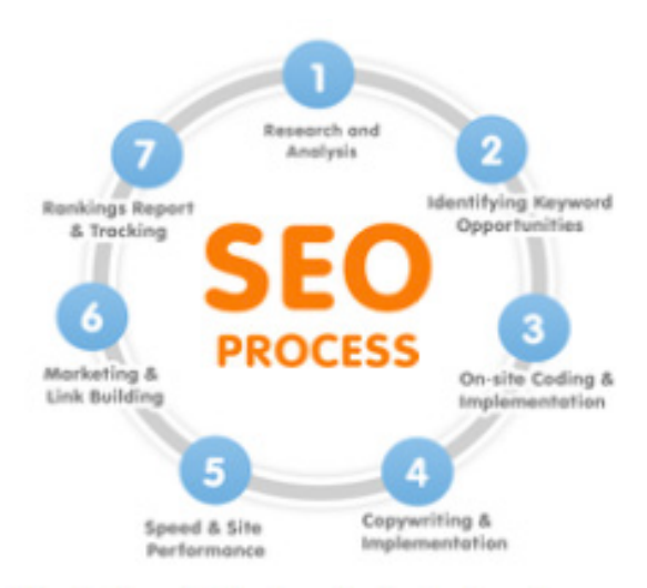
Fig.2: Search Engine Optimization Process