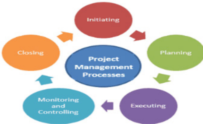
Fig.3: Engineering Project Management Processes

To be admitted to the Engineering management program, candidates should have: