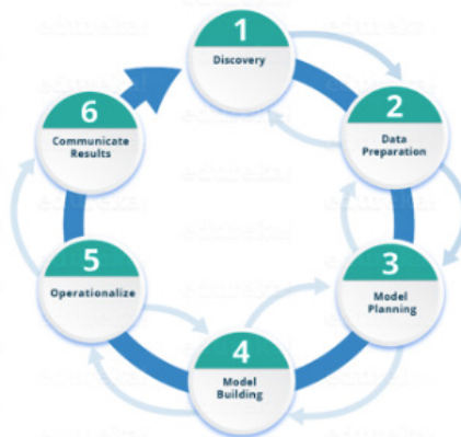
Fig.1: Life cycle of data science and Engineering

So we tend to asked rule of information Science Education, if he had a far better answer. Turns out rule work associate degree unbelievably useful framework that is each the simplest way to grasp what information scientists do, and a cheat sheet to interrupt down any information science drawback. The information Science Process that he outlines very well in a very short 5 day email course. Here is an outline of his insights.