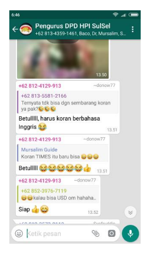
Figure 4: Emoji placement in sentences

closing conversation, 14% are in the middle of a sentence and 9% are at the beginning of a sentence. One example of using emoji at the end of the sentence is in figure 4 below.