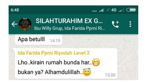
Figure 5: use of emojis in sentences

The character of the conversation performer can be known through the smileys and people type emojis used. Emoji's communication used describes his identity. The grinning face emoji facial expression shows the meaning of fun and excitement, so WA users can use the emoji to express feelings.