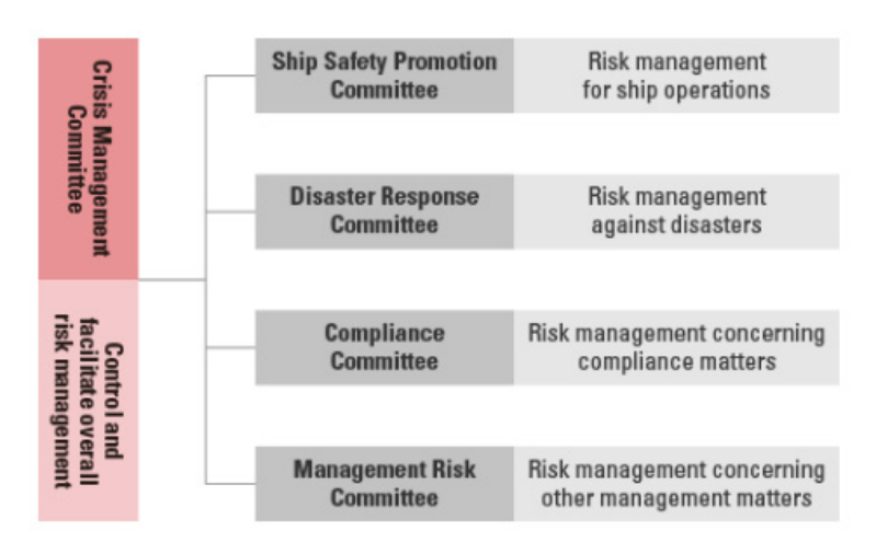
Figure 5: Risk Management Governance