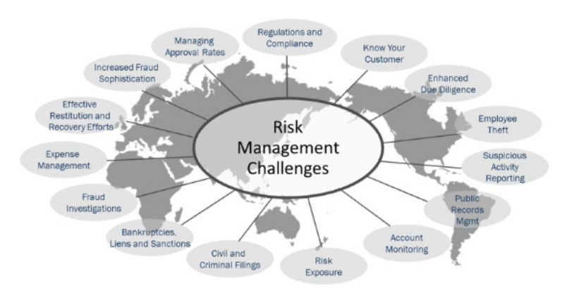
Figure 3: Challenges of Risk Management

Responsibility for Risk Management Risk management is the responsibility of the association's administration,