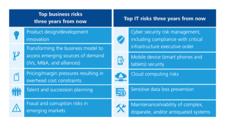
Table 4: Main Business and IT Risks