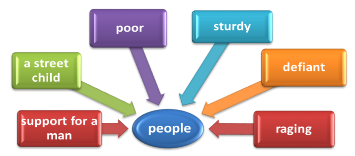
Figure 1: Linguistic cognitive model of the concept people

The main context markers connected with the concept people are the following: theft, power, national wealth, savages, robbing people, Kazakh people, to become mature, mischievous people, difficult life, etc.