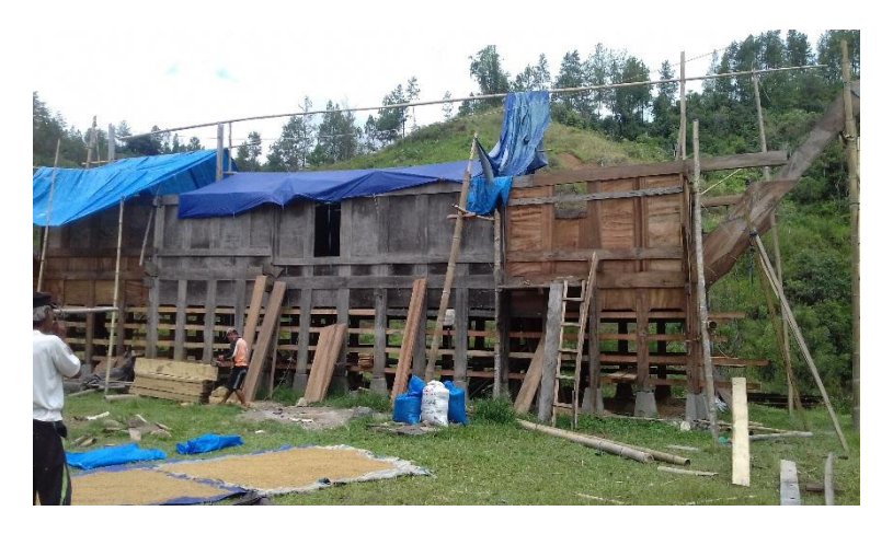
Figure 2. Installation of pole and wall construction has been completed (Banua Sikapu'mi)

For Mamasa and the surrounding area, a part from tallu rara, also keep doing the ritual when ma'pasipulung (grouping of construction type), when installation of penulak, (main pole in front and back of the house) and when installation longa, far ahead and back). Especially for the penulak at the time of when the back rod is installed, they should cut pigs while construction of the front penulak, involves cutting a rooster because the traditional house in Mamasa is also symbolized as a rooster. Usually after the installation of the pole and the wall construction has been completed the house is currently used for rest and the house is dibarungngi (temporarily topped) while waiting for a more liberal time, especially in terms of finance to continue construction of the house (Figure 2).