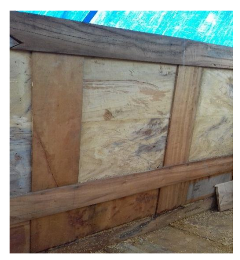
Figure 1. Wall installation (Rinding angin or Rimbang)

Then, the custom orientation of the house must be facing Buntukarua (the valley of the water sources) or river upstream because the river upstream is considered as the source of life. For the Nosu and Pana areas each installation of the construction parts, such as bondon installation, (rearmost chamber) shall cut one pig, mounting pata or wood between the introduction (west side floor) and pollo (east side floor) cut a one-tailed pig, ba'ba (central or main room) also cut one pig, and every important piece of construction should also involve cutting a pig like manete (ridge), and other construction parts.