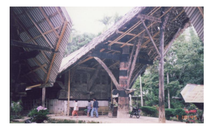
Figure 5. Mamasa Traditional House (Banua Layuk Rambusaratu') who is around 400 years old

to the south and repeats the spell reading, and puts down another chalk series. The above is done three times, i.e., walks to the north and puts the lime of betel and also three times to the south while laying the white betel while reading the same spell. As for the meaning of the spoken language of the rite, the outline is: the first part explains the existence of the Tomanarang who is in his house then gets a message or called home to come to a traditional party performed by the host in connection with the construction of his new home. The second part describes the situation or route that is lived until arrived in the village in question. The third section tells the parts of the construction of the house from the bottom to the top of the roof, and the last part is a request to the Gods so that the owner of the house grew rich, and lived prosperous. One of the large traditional houses belonging to the Banua Layuk type is Banua Layuk in Rante Buda Mamasa, which is the position of Hadat Rambu Saratu, the traditional ruler around the city of Mamasa in the past, as in the picture below.