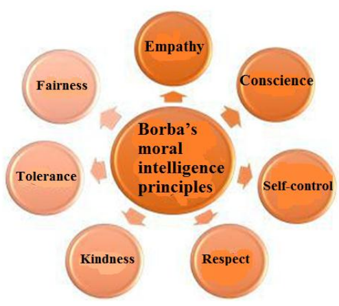
Figure 1. Moral intelligence principles in viewpoint of Borba

Borba believes that three virtues of empathy, conscience and self-control form the basis of moral intelligence. In fact, these virtues are such important points for moral intelligence that she calls them the moral code. When the basis of moral code is built strongly, it is possible to other moral virtues to them that are respecting the life and kindness, which is the feeling of human modesty and compassion in relationships. Two final virtues (tolerance and fairness) are bases for justice and civilization. These seven virtues can guide your child toward a responsible life and moral behavior (Borba, 2005).