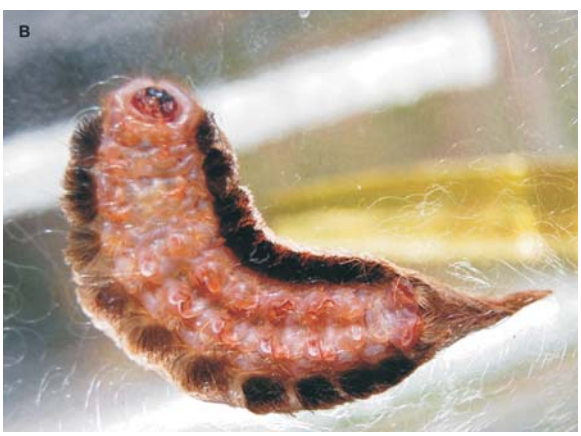
Fig. 3. Caterpillar (Megalopyge opercularis). A. Dorsal view. B. Ventral view.

come out feeding mainly on deciduous trees and shrubs (2).