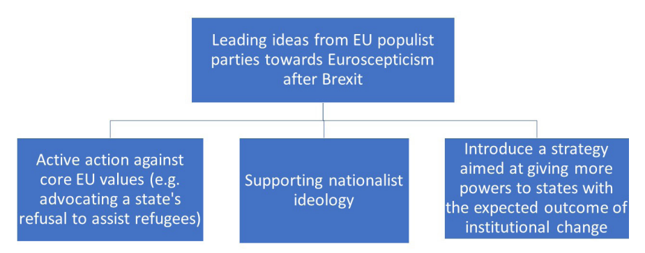
Figure 4. Vectors of influence of EU populist parties on ideas of Euroscepticism after Brexit (as summarised by the author)

There was no fundamental erosion of the political party system, as happened in France or Italy. The Germans therefore had little motivation for radical change. They were among the biggest beneficiaries of the bloc's single market and the eurozone. At the same time, Euroscepticism has grown steadily in many other member states. After Brexit, there were widespread fears that the EU would break up. Berlin's response to this was to prevent the break-up of the EU, but it had no clear idea how to move forward. It can be stated that Brexit is a clear manifestation of Euroscepticism and a consequence of the subversion of populist parties. This event has fundamentally transformed the ideas of the respective political movements (Figure 4).